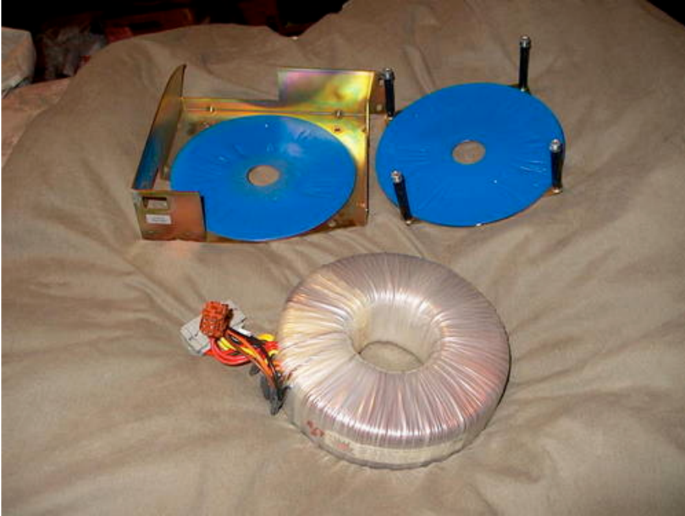
4. Toroid removed from the frame.