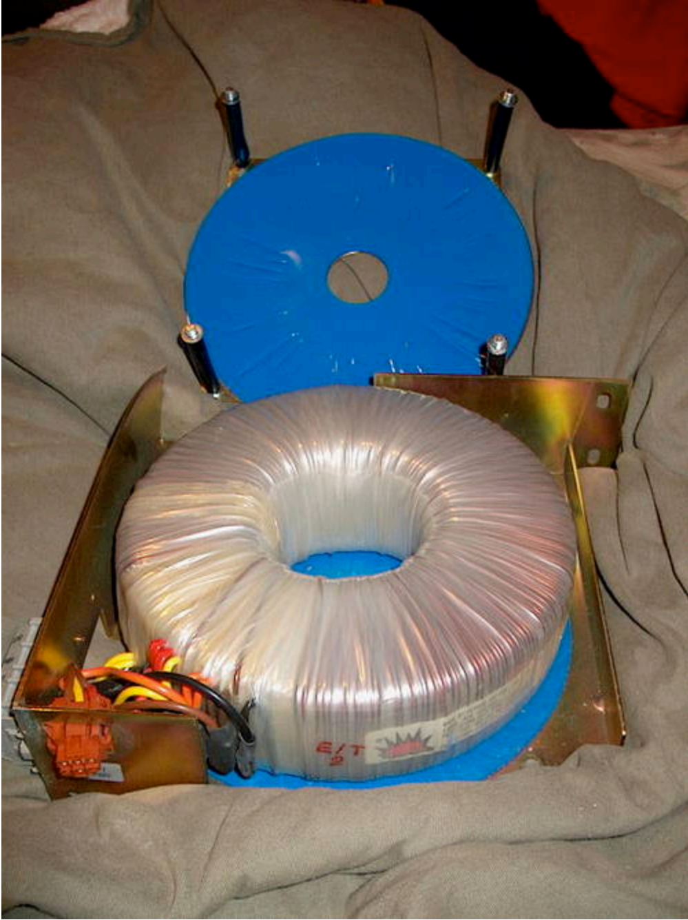
3. Top cover removed.